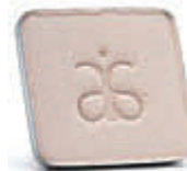
Linen (warm) #1553 Base color