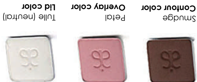
Smudge Contour color Tulle (neutral) Lid color